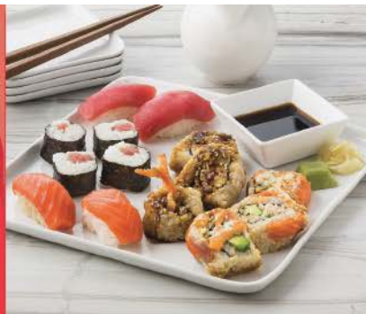
Freshly Made Sushi

Chomping at the bit for a quick and satisfying meal or refreshment?