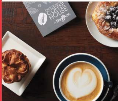
Chocolate Fish Coffee