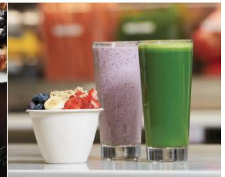
Organic Juice Bar