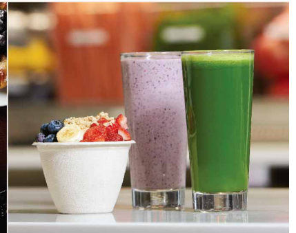
Organic Juice Bar