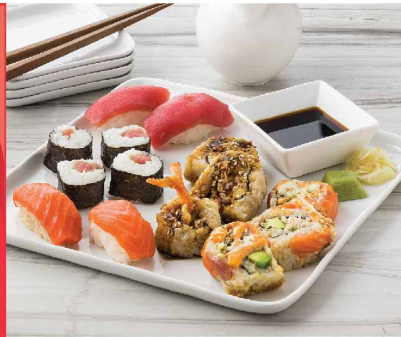
Fresh Made Sushi

Gallop over to 7315 Murieta Drive or shop online for store pickup at raleys.com/shop