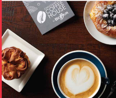
Chocolate Fish Coffee