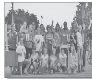
2013 Youth Horsemanship Challenge participants

*Participation in all three tiers is mandatory for eligibility